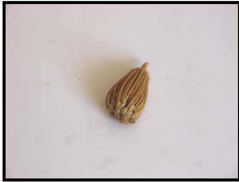
Toothpicks from Ghana