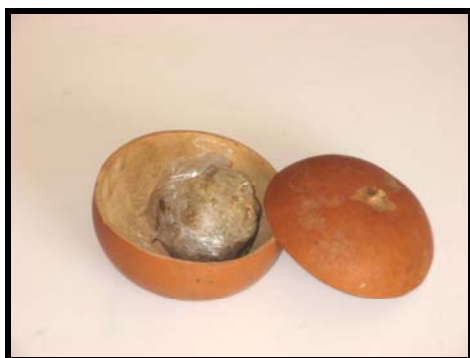
Soap from Ghana