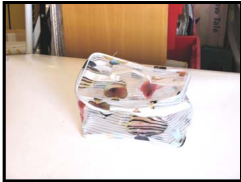
Washing Bag from Morocco